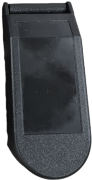
KSQ ABS LC

Designed, developed and manufactured in Australia by KSQ for the physical protection of MiniK10 Digital lock range, K1603BP MK range and the Ultra 7440 L combi cam range. Protects by minimising accidental damage, deliberate or forcible misuse, tampering, and indirect exposure to environmental elements such as dust and water.