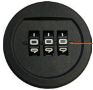
Default Code 0-0-0