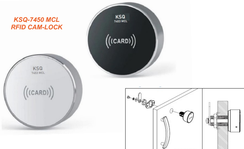
KSQ-7450 MCL RFID CAM-LOCK