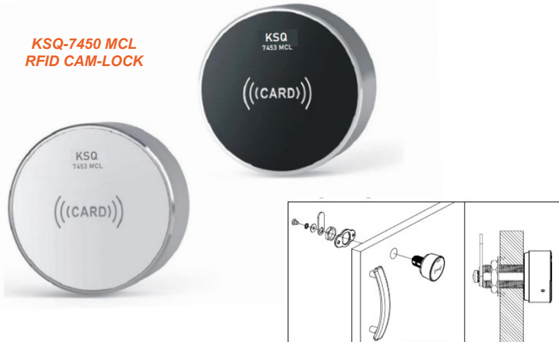
KSQ-7450 MCL RFID CAM-LOCK